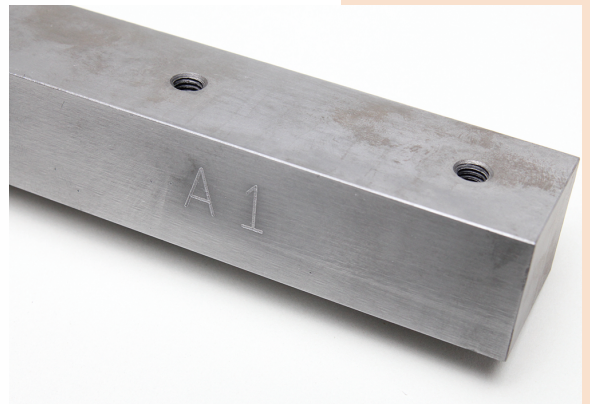
Marking on hardened material HRC62