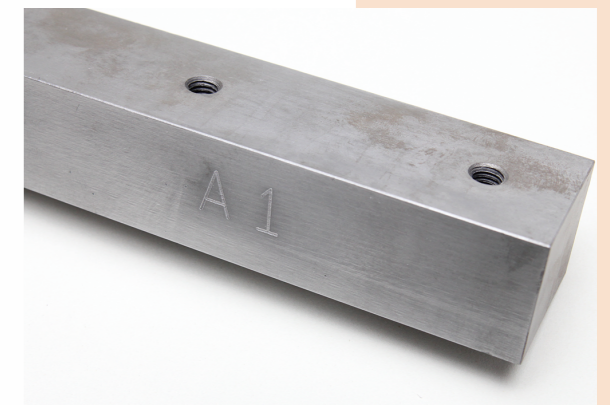
Marking on hardened material HRC62