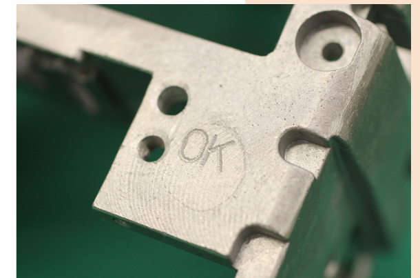
Identification mark on aluminum cast