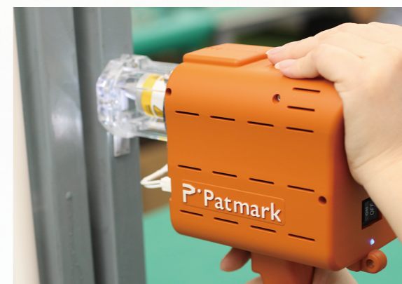
Marks in any orientation.