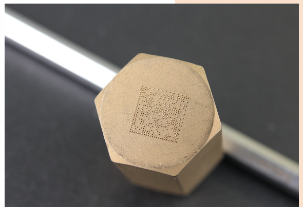
Readable 2D code by smartphone