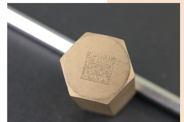
Readable 2D code by smartphone