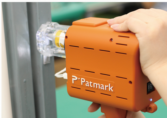
Marks in any orientation.